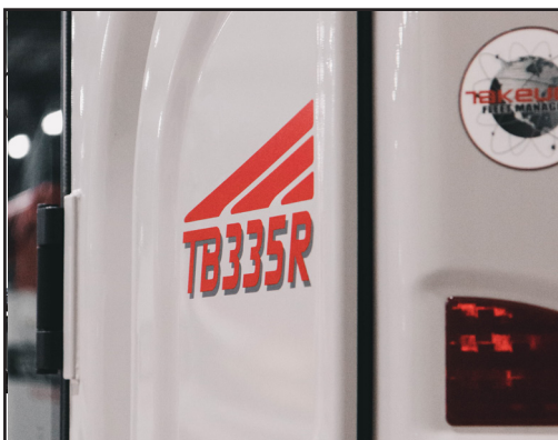
All Steel Construction