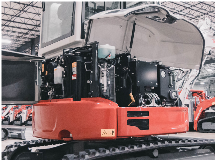
Easy Service Access with Wide-Opening Hoods