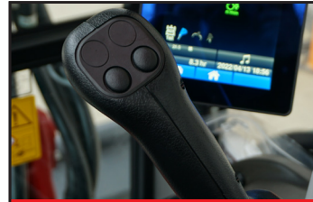
Hydraulic Joystick Controls