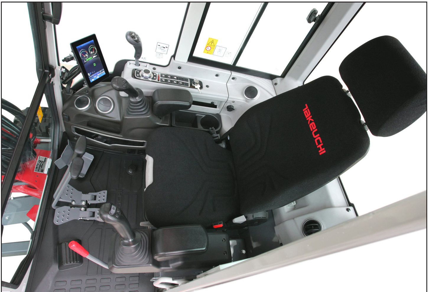
Completely Redesigned with Intuitive Jog Dial and Touch Pad Operation

Daily inspections and maintenance are easy to carry out thanks in part to a swing out engine hood and overhead opening right side cover. With the hoods open, the operator can quickly inspect the water separator, radiator and oil cooler, hydraulic oil level sight gauge, fuel level, dual element air cleaners, coolant level, engine oil dipstick, and battery.