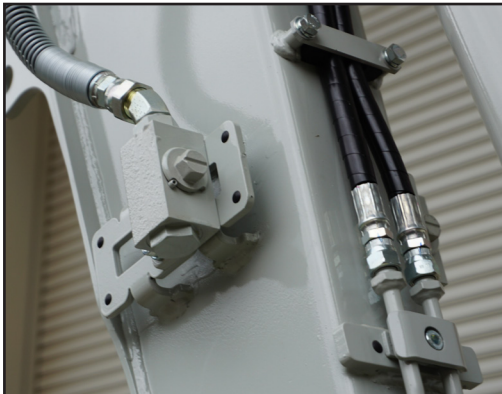
Up to 4 Service Ports (Optional)