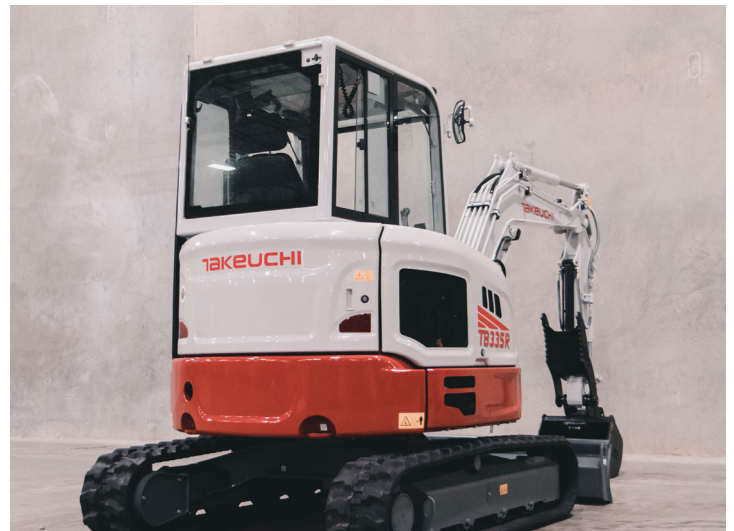
Short Tail Swing

*Functions may not be available in all countries, so please consult your Takeuchi dealer for details.