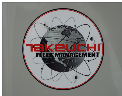
Takeuchi Fleet Management