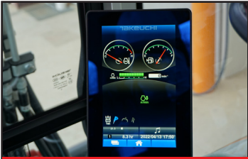
7" Touch Screen Display (CAB)