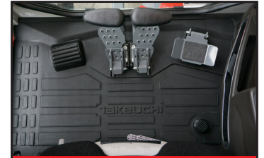
Large Floor with Foot Rest

The latest 300 series excavator, the TB335R features a minimal tail swing design that allows you to focus more on the work you are performing and worry less about rear swing impacts. Operators will find that the compact radius of the TB335R will provide excellent maneuverability and accessibility to confined worksites without sacrificing stability. While powerful bucket and arm crowd forces and a wide working range will deliver unmatched performance.